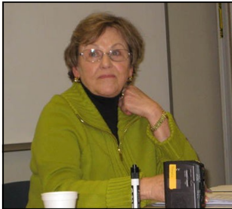
Special thanks to Candace Pratt for superb facilitation of Program Planning 2011.