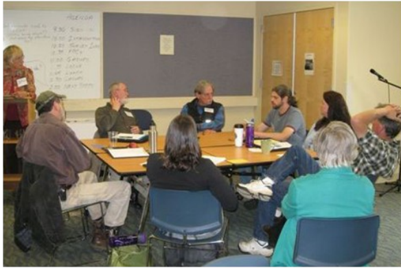
Summit Meeting October 7, 2010

The League of Women Voters of Clallam County sponsored a summit meeting October 7, 2010 in Port Angeles to explore the potential for establishing a local Food Policy Council. The purpose of the meeting was to discuss the results of a survey that had been conducted by the League earlier this year. The survey, conducted through interviews of 42 persons from all sectors of the food system, was created to clarify the need for, the issues of, and a possible structure of a Food Policy Council.